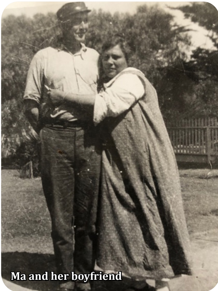
Ma and her boyfriend